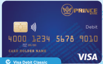
✔ Visa Debit Classic