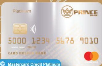
✔ Mastercard Credit Platinum