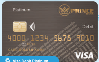
✔ Visa Debit Platinum