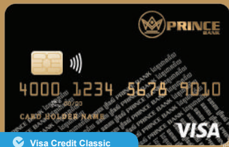
✔ Visa Credit Classic