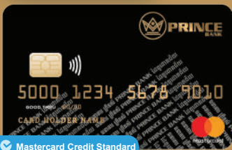
✔ Mastercard Credit Standard