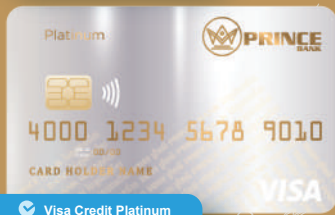
✔ Visa Credit Platinum